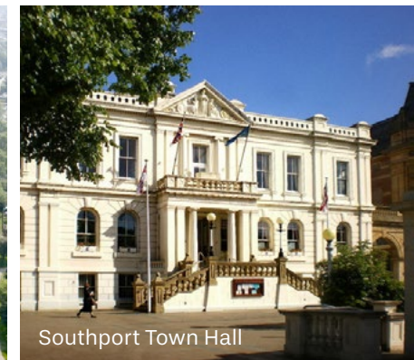
Southport Town Hall