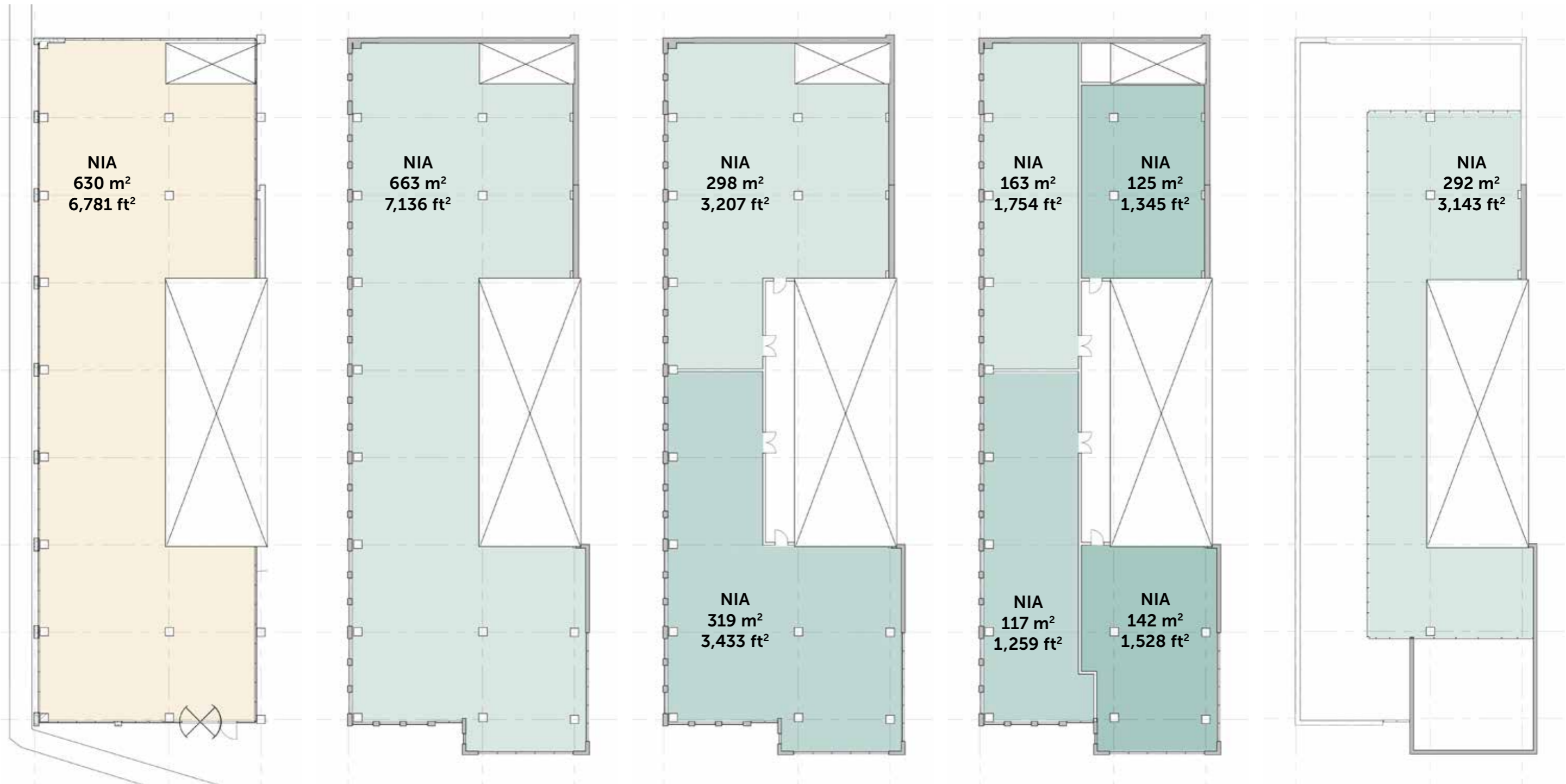
Roof Terrace Floor Plan